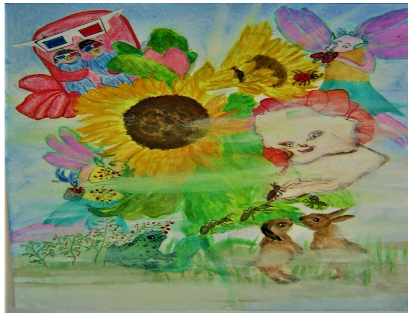
About The Author